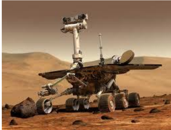
Fig. 3: A Mars Exploration Rover.

Finally, autonomous warehouse robots, designed by Kiva Systems, now help humans fulfill orders for several on-line retailers, including Zappos and Amazon.com (who recently acquired Kiva Systems for $775 million 12 ). These robots bring whole racks of merchandise to a human who selects the appropriate items for a given order, and puts them in a shipping box. The robots are centrally-coordinated by the inventory system, and operate autonomously. The robots have no on-board sensors, and rely on wires embedded in the factory floor to determine their location. However, they certainly seem to have their own mental agency as they avoid each other and reconfigure the storage locations of items in the warehouse based on customer demand. (See Fig. 4).