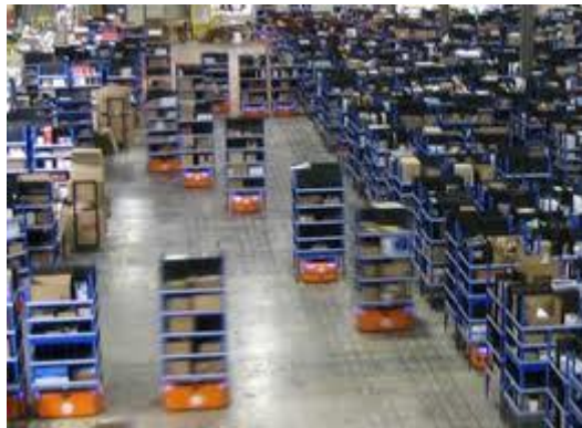
Fig. 4: The Kiva Automated warehouse system [Kiva Systems].

Finally, autonomous warehouse robots, designed by Kiva Systems, now help humans fulfill orders for several on-line retailers, including Zappos and Amazon.com (who recently acquired Kiva Systems for $775 million 12 ). These robots bring whole racks of merchandise to a human who selects the appropriate items for a given order, and puts them in a shipping box. The robots are centrally-coordinated by the inventory system, and operate autonomously. The robots have no on-board sensors, and rely on wires embedded in the factory floor to determine their location. However, they certainly seem to have their own mental agency as they avoid each other and reconfigure the storage locations of items in the warehouse based on customer demand. (See Fig. 4).