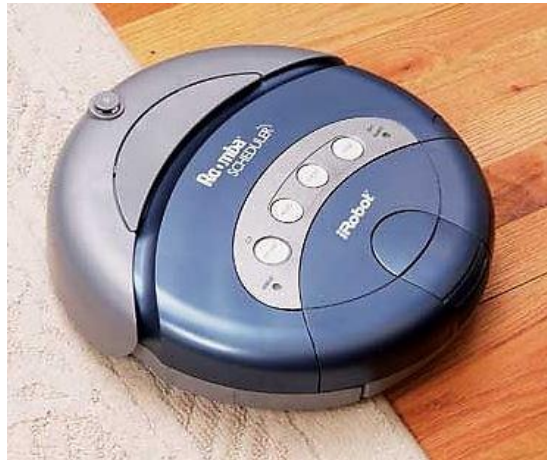
Fig. 1: iRobot Roomba [iRobot Corporation].

achievement than one might think, especially given these inexpensive robots are available to consumers for only a few hundred dollars, depending on model.