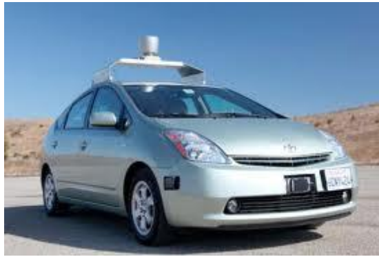
Fig. 6: A Google driverless car.

These research robots are starting to make the transition into the real (or, at least, commercial) world. Google has a fleet of self-driving cars that have traveled more than 150,000 miles on the US road system without incident. (See Fig. 6). Robots used as therapeutic aids are available, and quickly becoming more widespread. 16 Robots are being evaluated as assistants in the homes of individuals with severe motor disabilities. 17 These trends will only accelerate in the coming years. More and more robots will enter our daily lives in the coming decade, and it is likely that many people will own a (useful) personal robot by 2022. This appearance of robots will drive a number of legislative challenges.